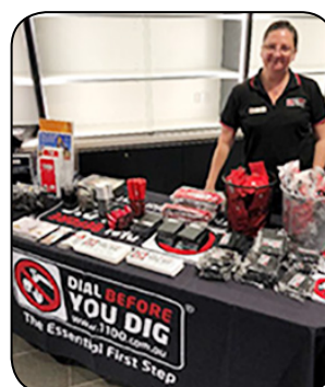
DBYD WA Mid-Year Forum

Thank You to all that attended. It was a great evening; filled with robust discussions, encouragement, and feedback into Dial Before You Dig WA's service.