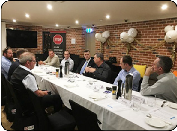
CCFWA Mid-West Roundtable Luncheon