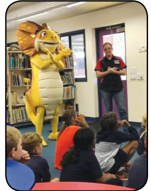
Onslow Primary School - Dial Before You Dig awareness and Horizon Power electrical safety presentation

Over the last couple of months the WA team has been at a number of events to spread awareness of the Dial Before You Dig service. Several awareness and toolbox presentation sessions were given to Members and Users. This included regional presentations in Onslow and Karratha, to Members, Users, community and primary school groups. The Dial Before You Dig WA team is also scheduled to exhibit and be involved in several trade shows and exhibits over the coming months and we look forward to seeing you there.