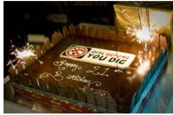
21st Birthday Celebrations