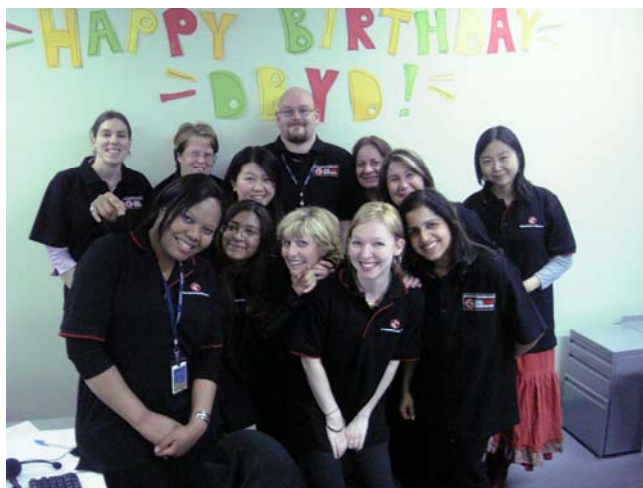
The Datacom Call Centre Team celebrate

Datacom hold the contract to provide us with our call centre service – so it's the Datacom team who are the friendly people who answer the phone when you dial 1100. That contract began in October last year so the DBYD team there recently celebrated their first birthday. We'd like to thank all of the team at Datacom for their ongoing hard work.