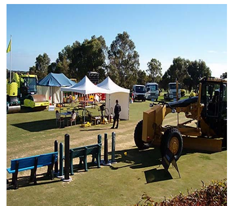
Local Government Supervisors Expo

Coming events are the Dial Before You Dig WA Customers/Members Forum in December, Master Plumbers and Gas