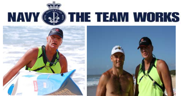
Scenes from the George Bass Marathon

Dial Before You Dig extends its congratulations to the ski paddlers and surf boat crews who battled the elements and made it to the end at Eden.